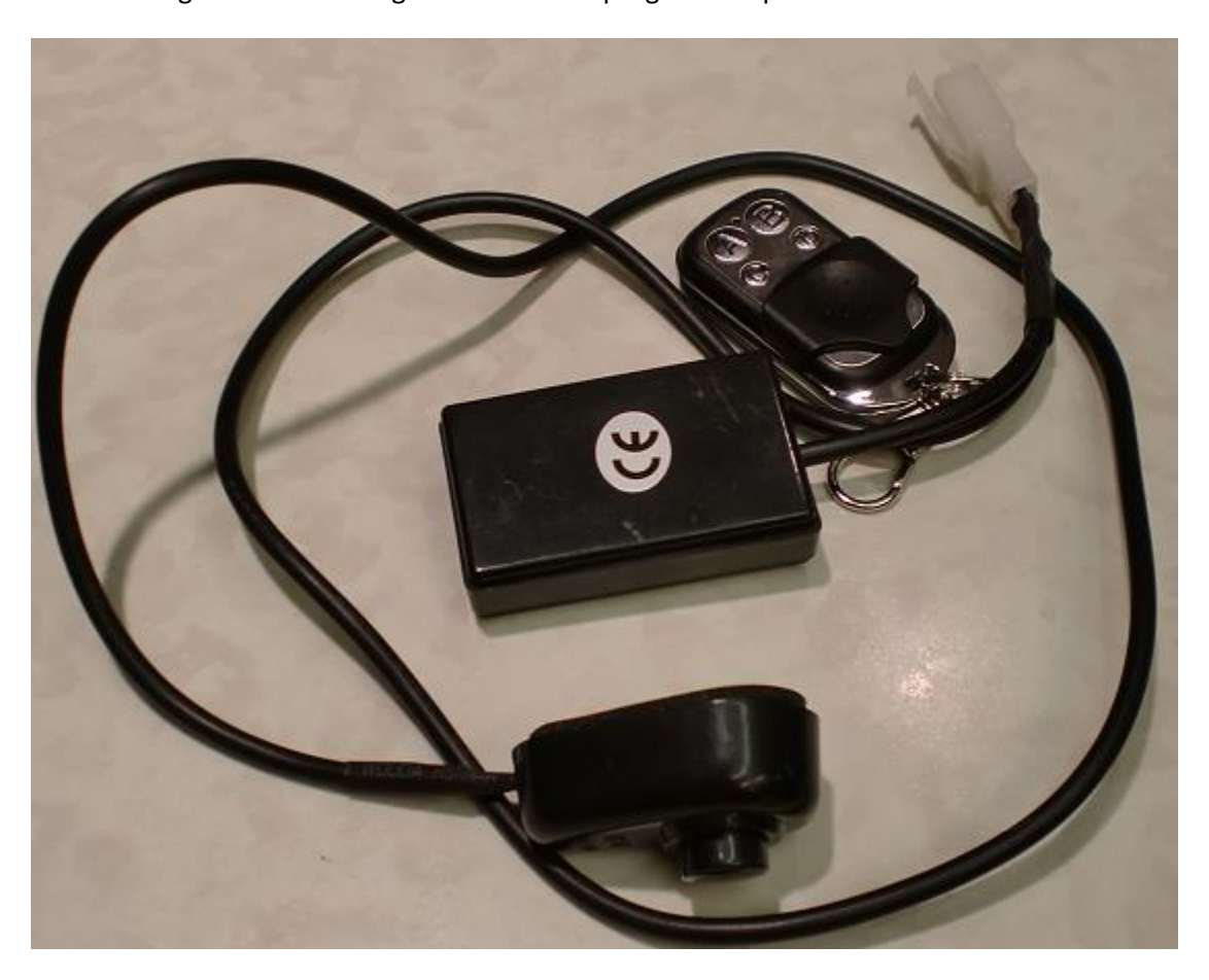
The Sub Programmable Wiring harness can be programed up to 2 functions.

The wireless remote has 4 buttons with the following functions: