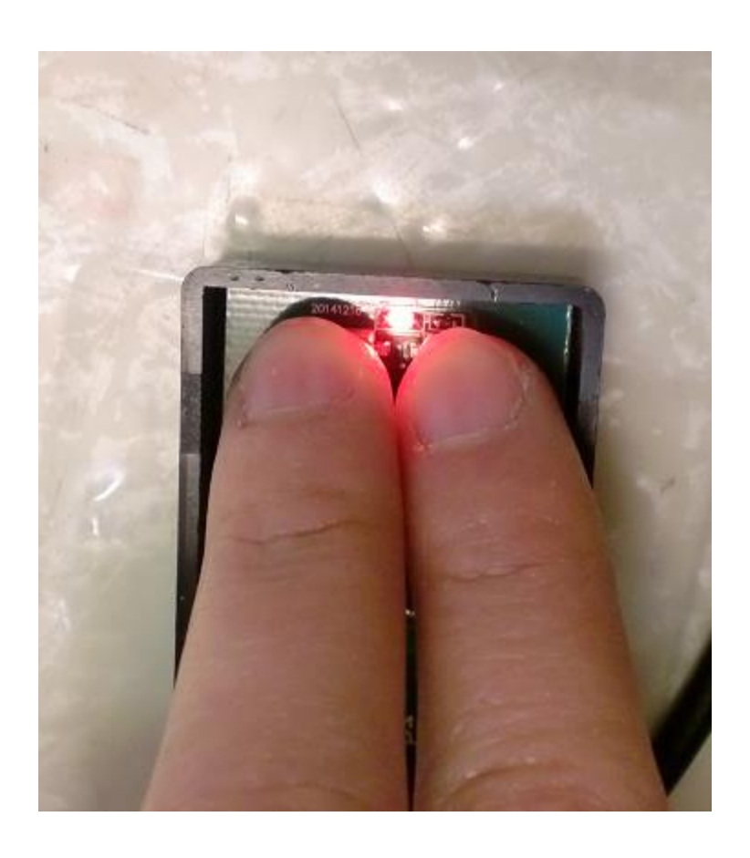
Step 2: As shown below place the wireless remote next to the programmable harness and PRESS AND HOLD the A Button. Now PRESS AND HOLD Button 1. – Continue to hold both for 5 seconds (if done properly during this time the light located in between buttons 1 and 2 will continue to flash).

This will program the WHITE function of the A Button into the switch/harness.