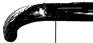
Side Bar(one side)

Part Number: 209007-2 Date: 03 2010 Serial Number: AR0000003040