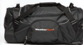
ROLLING DUFFLE TRAVEL BAG