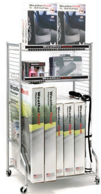
Adjustable Universal Display

RULES OF PROMOTION: Qualifying order quantities must be on one invoice and be for merchandise only. Proof of performance is required. Copies of qualifying invoice and corresponding order form should be sent to DiamondDealer@WeatherTech.com , or faxed to 630.769.0300 by June 8, 2020. Please include part numbers and reference FREE on the corresponding order form. No submissions will be accepted after the deadline.