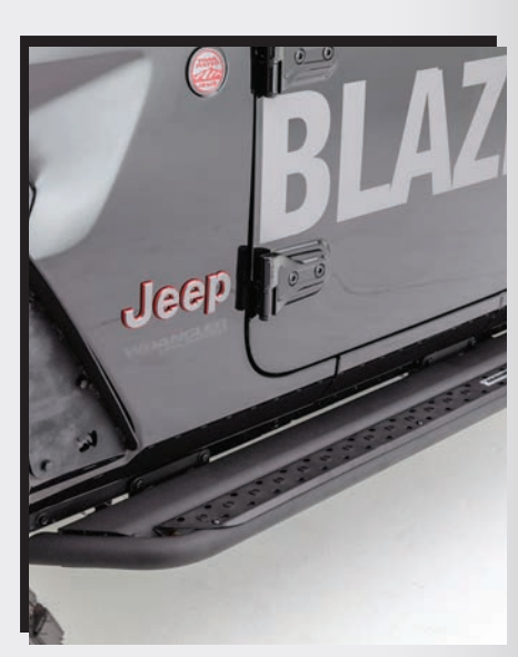
$25 eRewards Dominator DS and DSS Steps