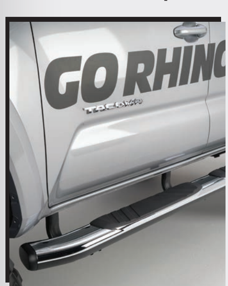
$25 eRewards 415 Side Steps