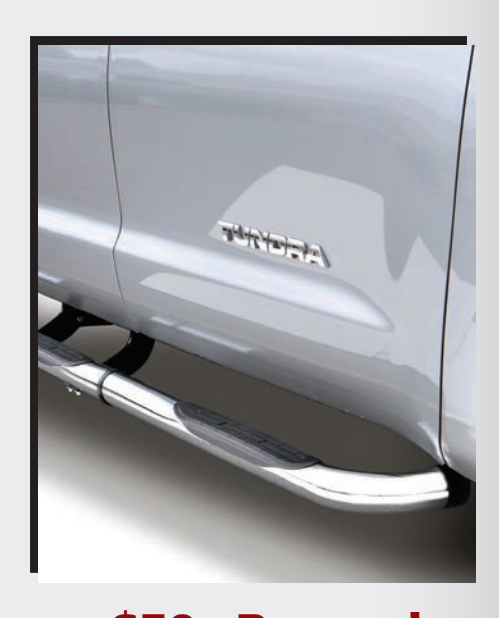
$50 eRewards 6000 Series - Wheel to Wheel Side Bars