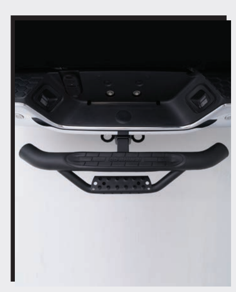
$10 eRewards Dominator Hitch Steps