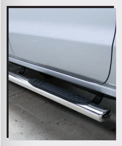
$50 eRewards 4", 5" & 6" OE Extreme Series Side Steps