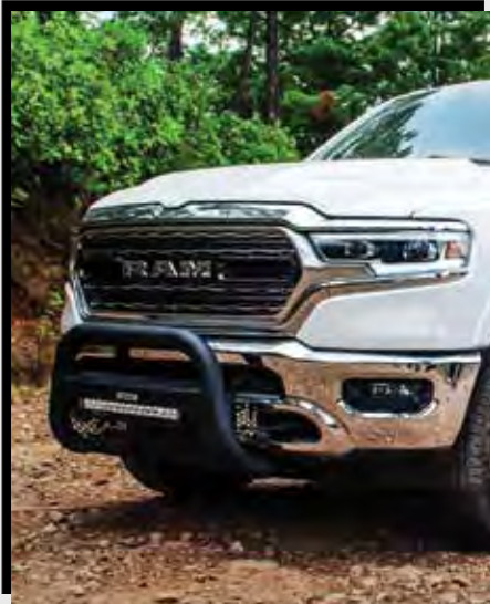
$25 eRewards RC2 LR w/ Go Rhino LED Lights