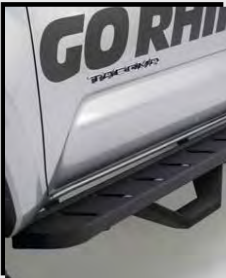
$75 eRewards RB10 w/ Drop Step Running Boards