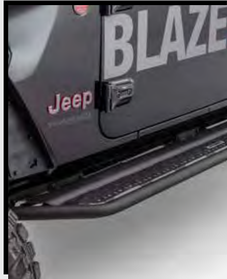
$50 eRewards Dominator D6 Side Steps