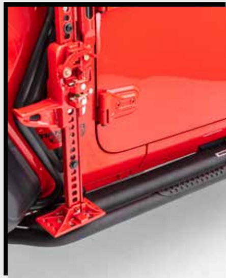
$50 eRewards Dominator DS Side Steps