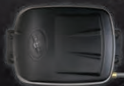
On-board air compressor

You don't need a bigger truck... You need Air Lift.