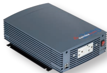
SSW-2000-12A 2000 Watt Pure Sine Wave Inverter