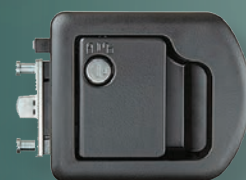
TriMark Motor Home Entrance Door Lock