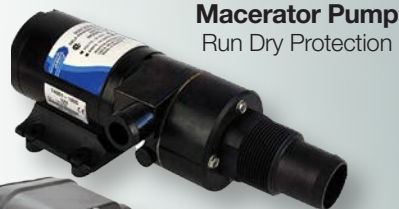
Macerator Pump Run Dry Protection