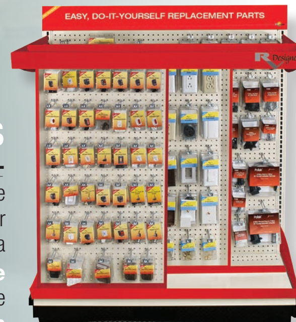
SlideGlide Planogram Core 5 153 Items

Categories Include: Cabinet, Hatch, Entry Door, Exterior Hardware, Interior Hardware