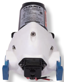
Triplex 2.9 RV Automatic Water System Pump