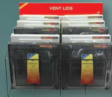
NEW! Vent Lid Display

Purchase a SlideGuide merchandiser and receive a $50 Dealer Cash Rebate PLUS receive FREE Installation