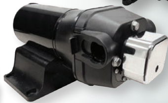
Award Winning V-Flo Constant Flow 5.0 Water Pressure Pump