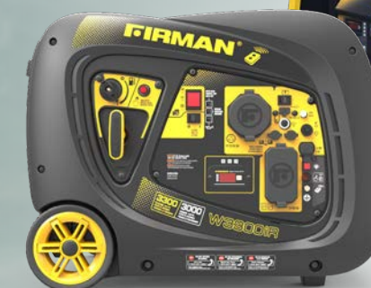
Model: W03083 3000 Watt Generator Whisper Series