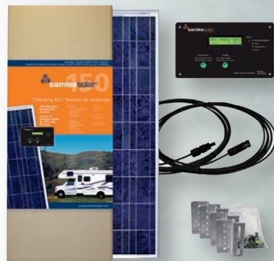
SRV-150-30A 150 Watt Solar Charging Kit