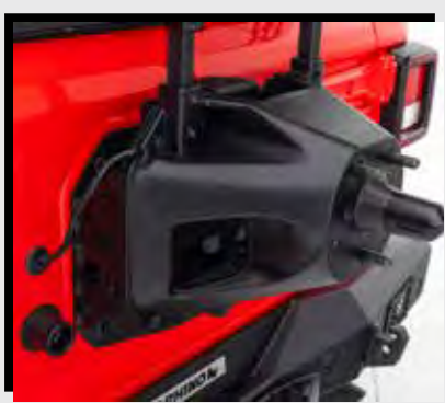
$25 eRewards JL Spare Tire Relocation Kit