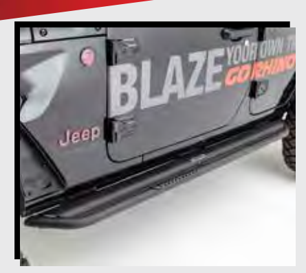
$50 eRewards Dominator DS Side Steps