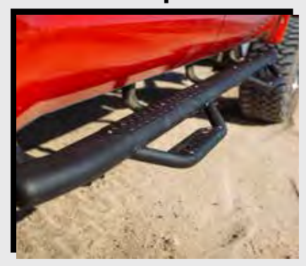
$50 eRewards Dominator D4 Side Steps