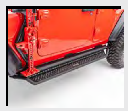
$50 eRewards Dominator D1 Side Steps