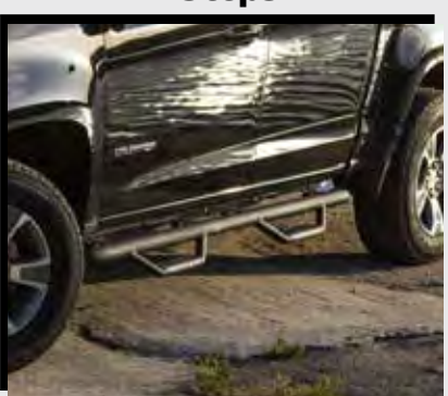
$50 eRewards Dominator D2 Side Steps