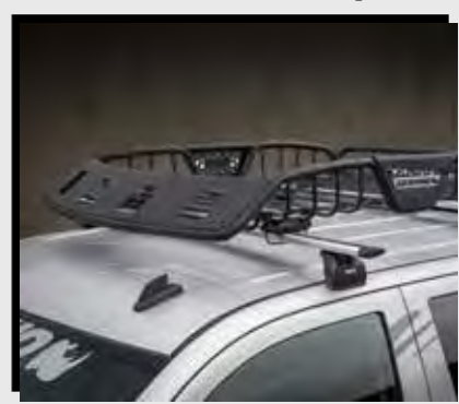
$50 eRewards SR Racks