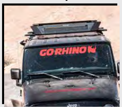
$50 eRewards SRM Racks