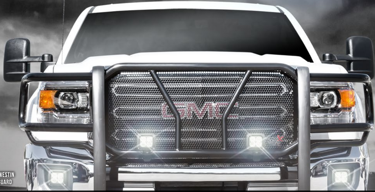
SHOWN WITH WESTIN HDX® GRILLE GUARD

QUALIFYING PRODUCTS (BLACK OR POLISHED):