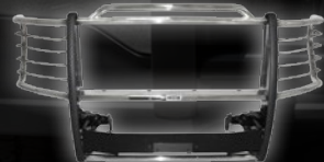
SPORTSMAN WINCH MOUNT GRILLE GUARD