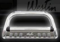
ULTIMATE BULL BAR