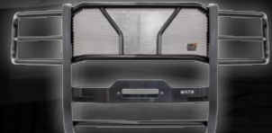
HDX® WINCH MOUNT GRILLE GUARD