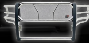
HDX® GRILLE GUARD