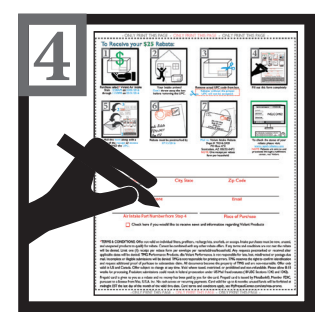
Fill out this form completely ALL FIELDS MUST BE COMPLETED TO RECEIVE REBATE