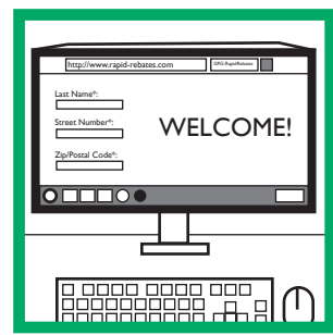
To check the status of your rebate please visit: www.rapid-rebates.com NOTE: Rebates are sent to and processed through a fulfillment center, not Volant.