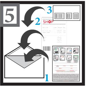
Mail this form along with a copy of the receipt or invoice AND the UPC.