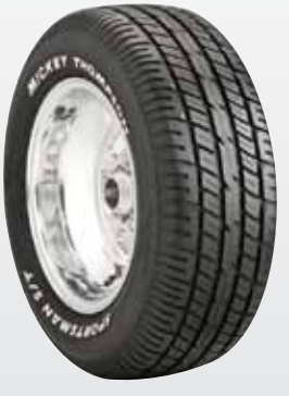
Sportsman S/T<sup>TM</sup> Radial White Letter for Muscle Cars and Trucks