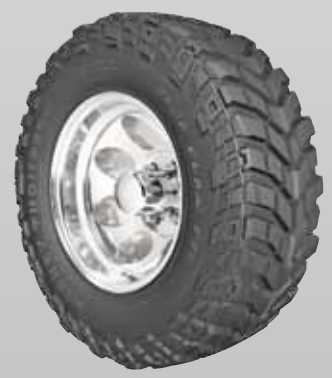
Baja Claw® TTC Extreme Terrain Radial