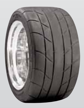
ET Street® Radial II DOT Drag Radial