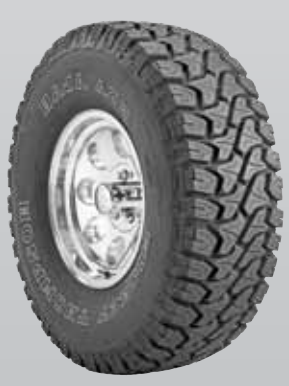
Baja ATZ<sup>TM</sup> All Terrain Radial