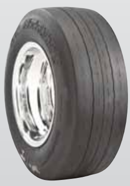
ET Street® Bias Ply DOT Drag Tire