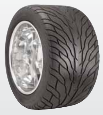
Sportsman S/R<sup>TM</sup> Radial Street Rod Tire Wide Rears, Skinny Fronts