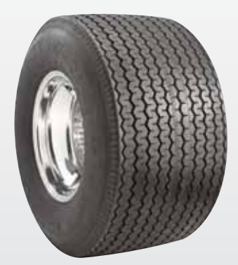
Sportsman Pro® Bias Ply Classic Street Rod Tire