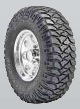
Baja MTZ<sup>TM</sup> Mud Terrain Radial