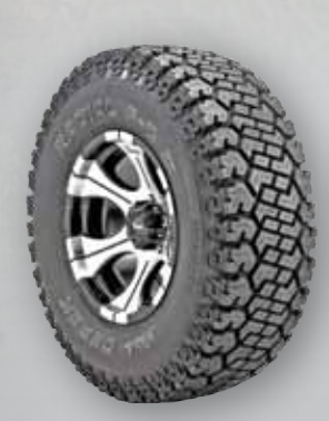
Radial F-C II All Terrain Radial