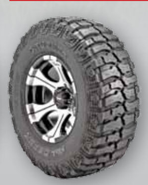
Crusher Extreme Terrain Radial