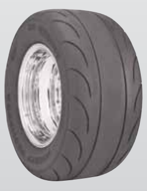
ET Street® Radial DOT Drag Radial