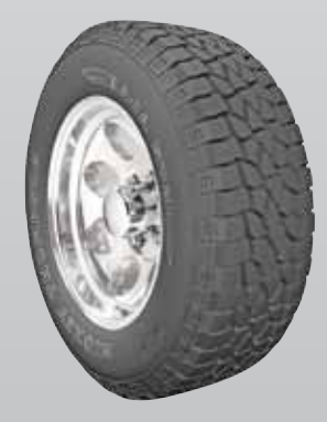
Baja STZ TM Street Smart All Terrain Radial OE Replacement Sizes