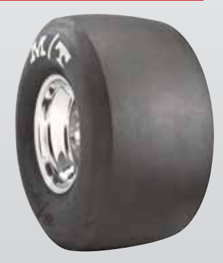
ET Drag® Bias Ply Drag Slick