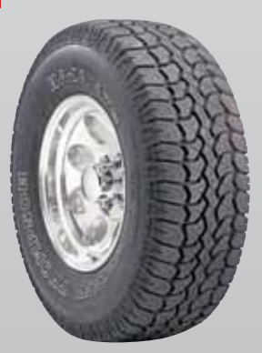
Baja ATZ<sup>TM</sup> Plus All Terrain Radial