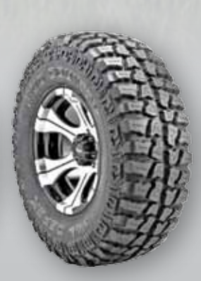
Mud Country Mud Terrain Radial