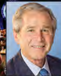
Keynote Address by President George W. Bush