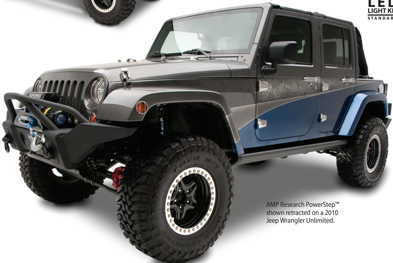
AMP Research PowerStep™ shown retracted on a 2010 Jeep Wrangler Unlimited.