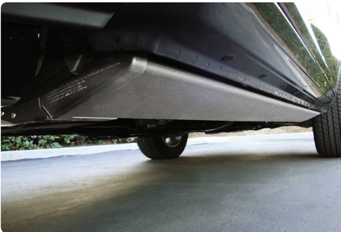
Deployed position – shown on a 2010 Ram Crew Cab