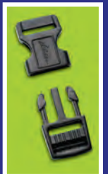
QUICK-RELEASE BUCKLES (NO TOOLS REQUIRED)

FEATURING SUPER-GRIP® The slip resistant fastening system