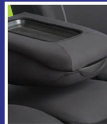
CENTER ARMREST/CONSOLE COVERS INCLUDED (MOST APPLICATIONS)