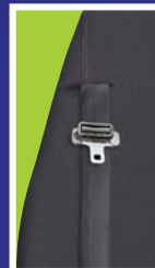
SEAT BELT OPENING CUSTOM FORMED