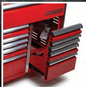
PROPANE TANK STORAGE