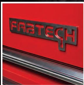
CUSTOM FABTECH LOGO