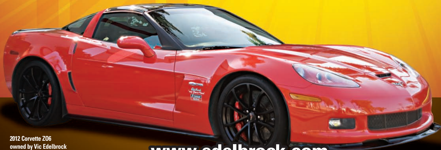
2012 Corvette Z06 owned by Vic Edelbrock

Promotion period is April 11 until December 31, 2013 Please see back of flyer for complete details and redemption coupon